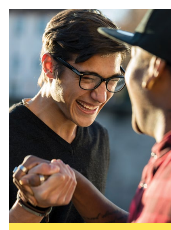
SHIFT SUPERVISOR PROGRAM SERVICES

The Covenant House Community Liaison Team build positive connections with youth, our neighbours and the community. Located at the two main entrances to Covenant House, Liaisons are welcoming to youth coming to access services and help maintain a calm, safe and peaceful space as youth gather outside our doors.